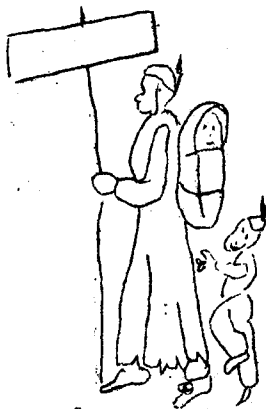
SHE HAS A WAY WITH NEOS!