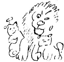
HE HAS A WAY WITH NEOS!