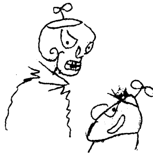
WHAT HAVE I DONE FOR NEFF? I JUST POSED FOR THE CLUB EMBLEM THAT'S ALL.